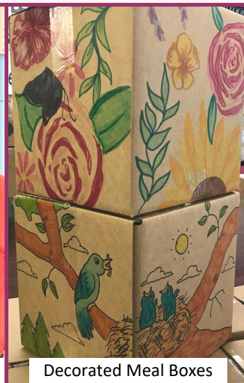
Decorated Meal Boxes