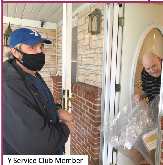
Y Service Club Member